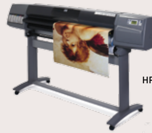
HP 5500 Large Format Ink Jet Plotter