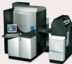
HP Indigo 3000 Digital Offset Press