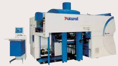
74 Karat Waterless Offset Press